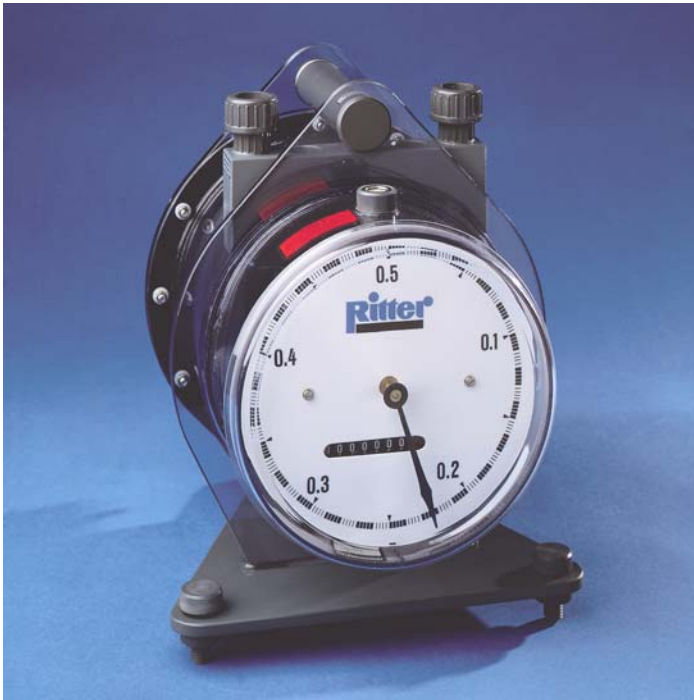
TG 05 Model 5 (PVC transparent)