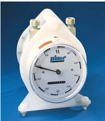
TG 1 Model 7 (PVDF)