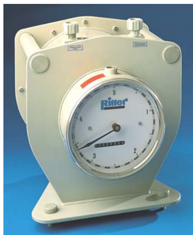
TG 5 Model 6 (PP)